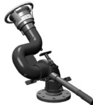
Figure No. 9027

STANDARD EQUIPMENT: Red painted finish. NOZZLES NOT INCLUDED. SEE PAGE 9-6.