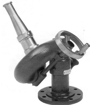
Figure No. 9031