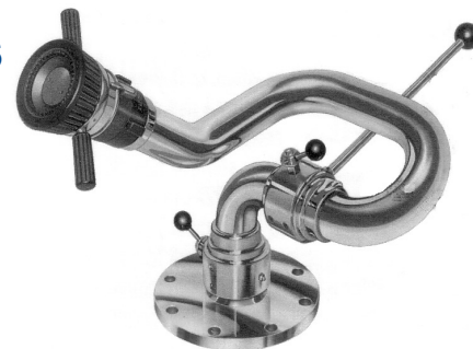
Figure No. 9033

STANDARD EQUIPMENT: All brass construction with stainless steel and brass twist locking mechanism. Stainless steel handle rod. Grease fittings on lower swivels. 2 1/2" NST outlet. Full 360 Degree rotation. NOZZLE NOT INCLUDED. SEE PAGE 9-6.