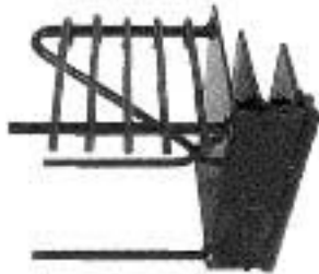
Figure No. 7088