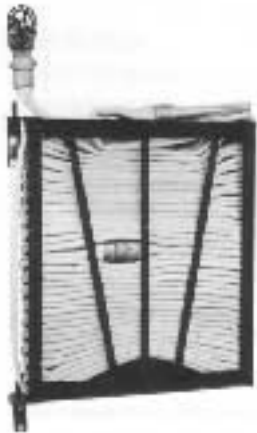
Figure No. 7080