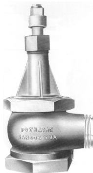
Figure No. 5235-5245

For Use as a Fire Dept Outlet Connection. Designed to Prevent Unauthorized Use.