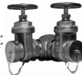
Figure No. 5250

Figure No. 5250 4 X 2 1/2" X 2 1/2" 5260 6 X 2 1/2" X 2 1/2"