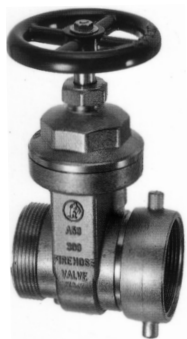
Figure No. 5150

STANDARD EQUIPMENT: brass body with brass trim, swivel inlet with pin lug. 2 1/2" size only. Red hand wheel.