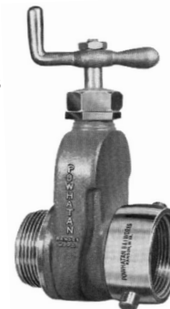
Figure No. 5155

STANDARD EQUIPMENT: solid top, brass body, painted red with polished brass trim, swivel inlet with pin lug. 2 1/2" size only.