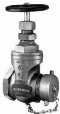
Figure No. 5130