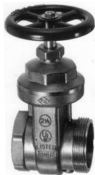
Figure No. 5135