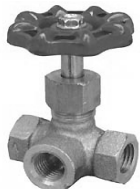
Figure No. 5662

Standard Equipment: 1/4" valve NPT Bronze three way globe valve with handwheel. Female inlets. 175 PSI.