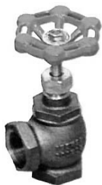
Figure No. 5663-5670

Standard Equipment: Bronze with teflon seat. 125 WSP.