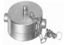
Figure No. 5709-5713