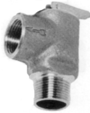
Figure No. 5660

For use on all closed systems to prevent damage in the event of a malfunction due to some foreign object or matter becoming lodged in an automatic regulating or control valve. Featuring a pop-type relief action for maximum performance.