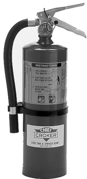
Figure No. 4305