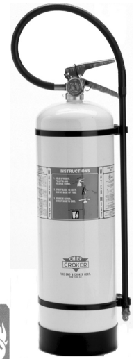
Figure No. 4206