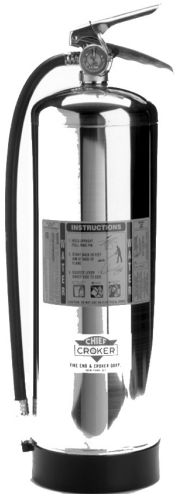
Figure No. 4202