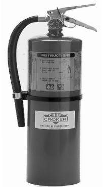
Figure No. 4310